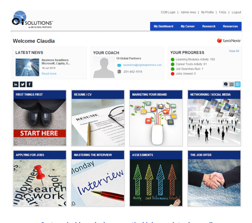
Custom dashboard where practical job search tools are all presented in one place to supplement the advantages of a personal coach